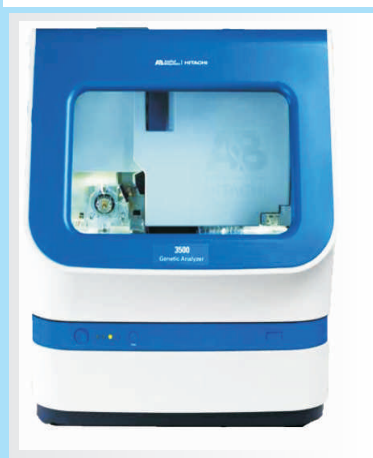
3500/3500xl Genetic Analyzer No one else offers the full sequence....