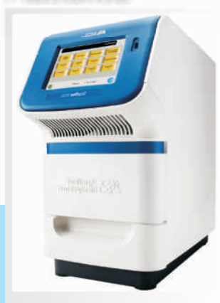
StepOne™ Real Time PCR System

Remarkably Simple System. Simply Remarkable Results.